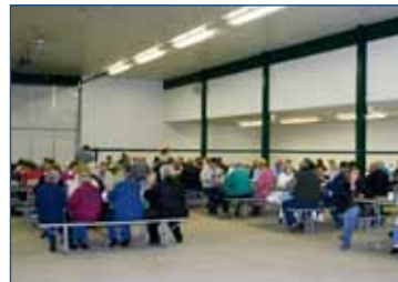
Members enjoy a meal before the meeting.